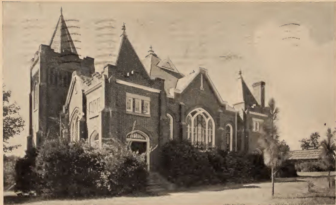
First Presbyterian Church, Carthage, North Carolina